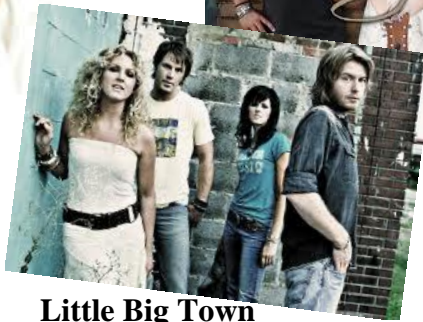
Little Big Town